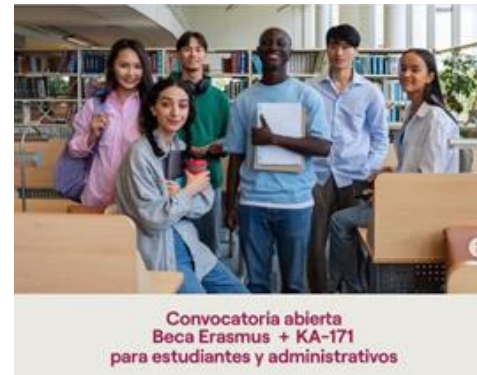
Convocatoria abierta Beca Erasmus + KA-171 para estudiantes y administrativos